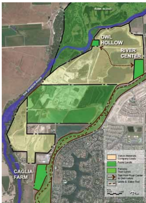
Land Ownership Overview