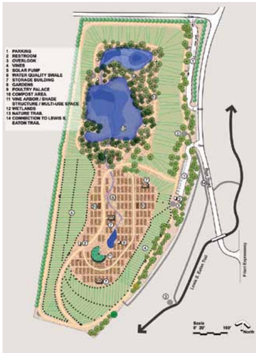
Community Supported Agriculture Site